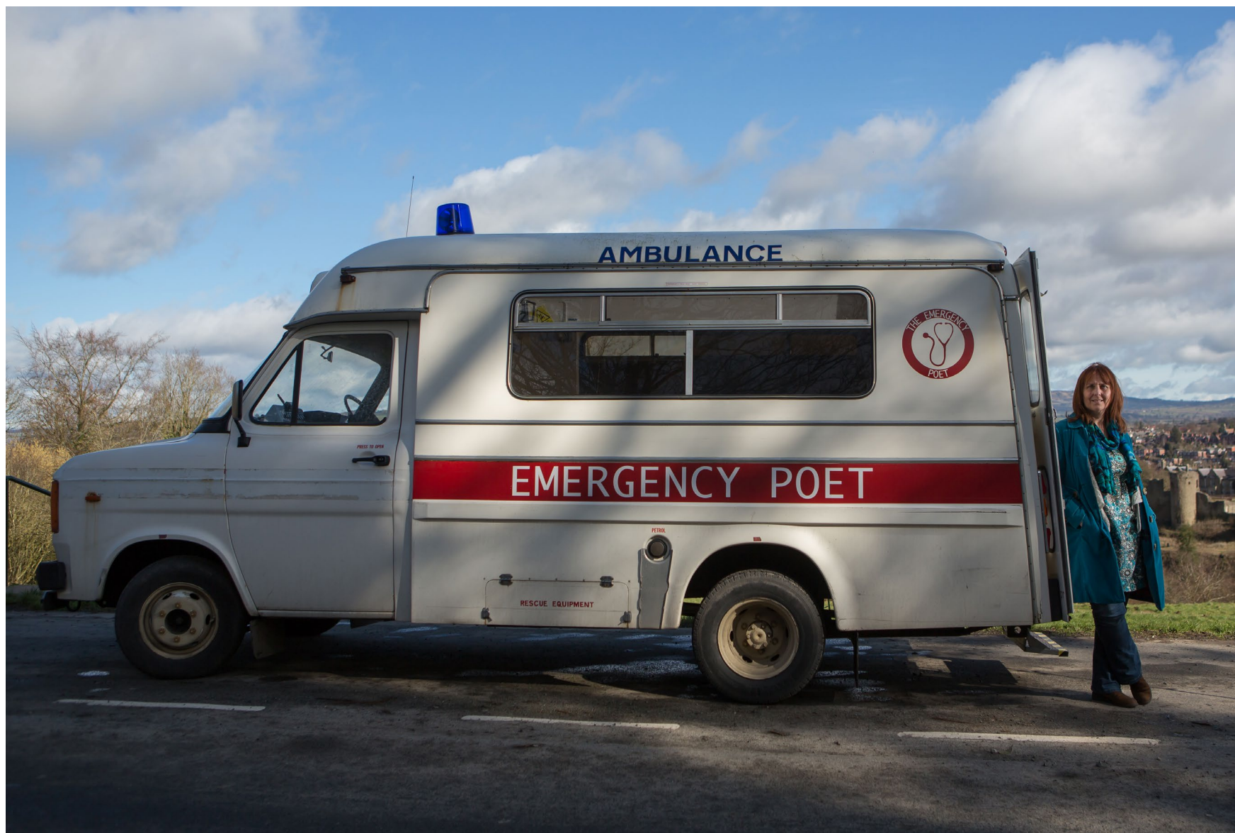
⤴ Poetry on prescription: the Emergency Poet