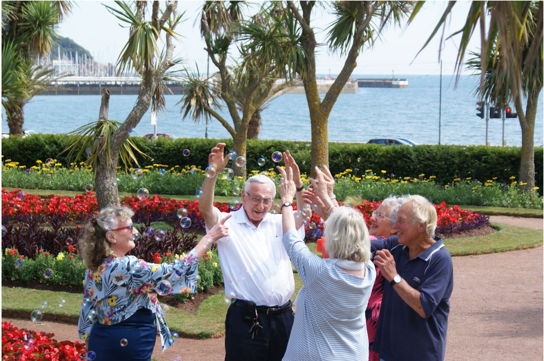
👤 Citizen Evaluators: Bursting bubbles in research